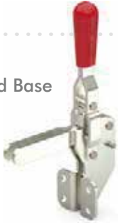
91090 Front Flanged Base Open Bar