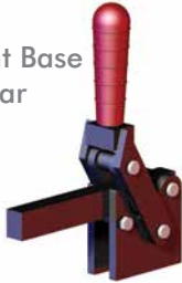
548 Straight Base Solid Bar