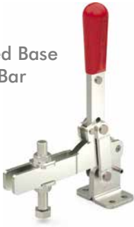
229 Flanged Base Open Bar