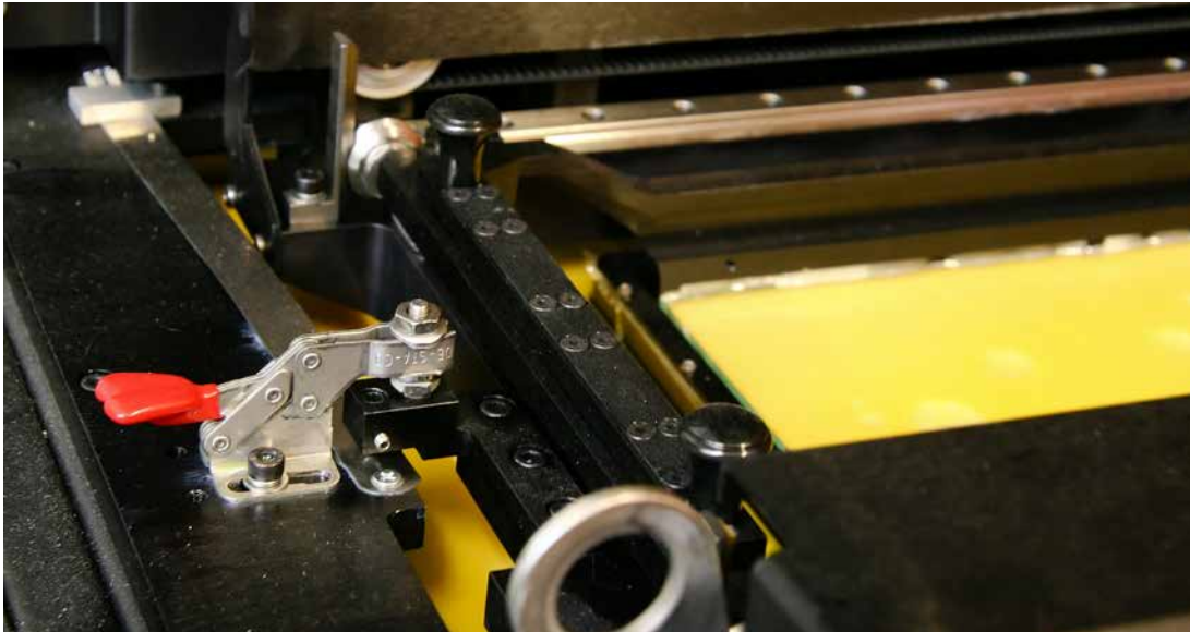
Model 206-HSS shown securing a platen on a prototyping machine.